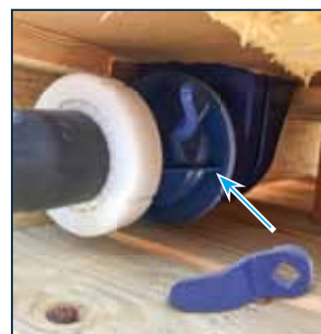
7. Put the blue key on top of the seal and turn the key down to open the seal