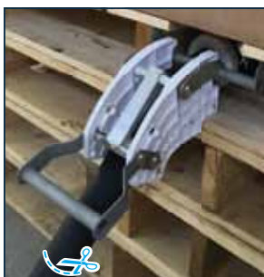
5. Shut off the tap and, if needed, cut it near the tap connection