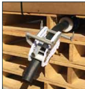
2. Pull the hose through the tap