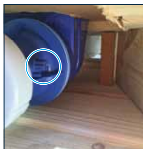
6. You will find the big box seal beneath the pallet