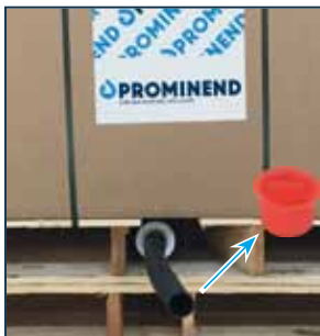
1. Pull the rubber hose out of the pallet and remove the red cap