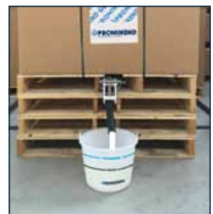
8. Open the tap to administer the milk