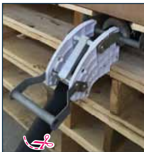
5. Shut off the tap and, if needed, cut it near the tap connection