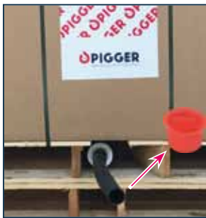
1. Pull the rubber hose out of the pallet and remove the red cap