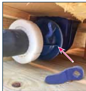
7. Put the blue key on top of the seal and turn the key down to open the seal