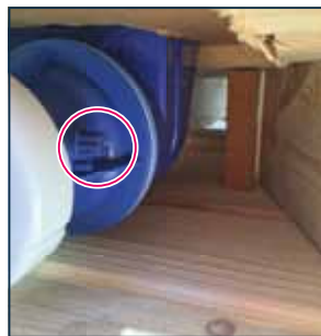
6. You will find the big box seal beneath the pallet