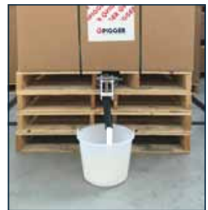
8. Open the tap to administer the milk